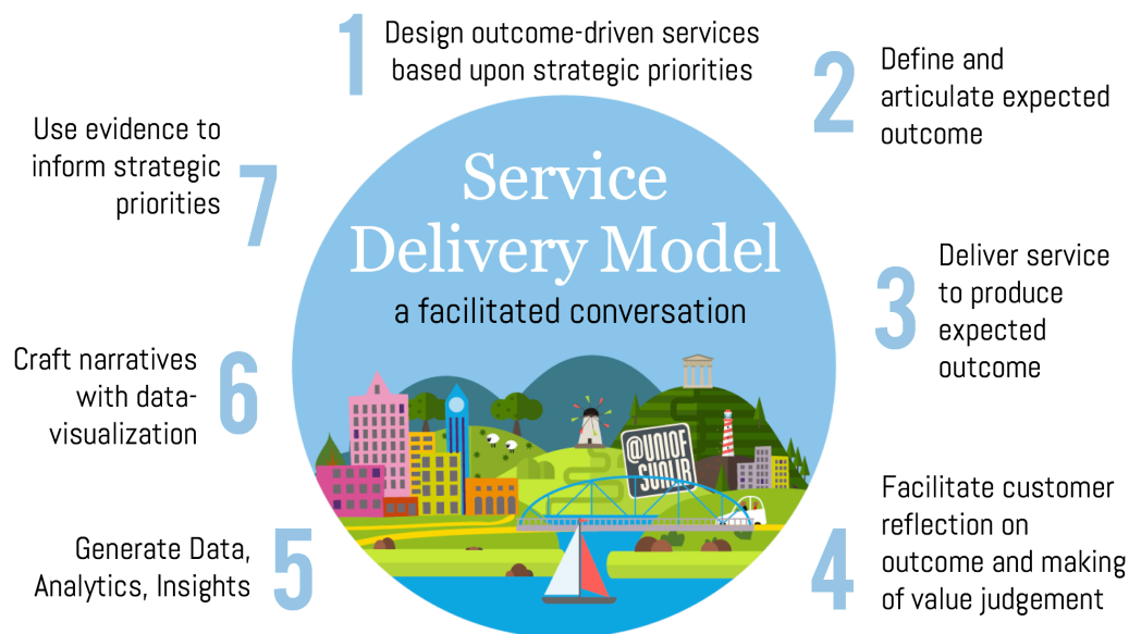
Figure 1. University of Sunderland Library Services, Service Delivery Model